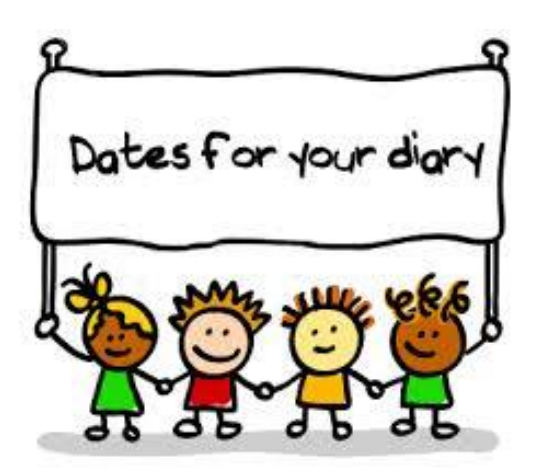
New and changed dates are given in bold

Mon 12<sup>th</sup> June: Father's Day Shopping PTA Event