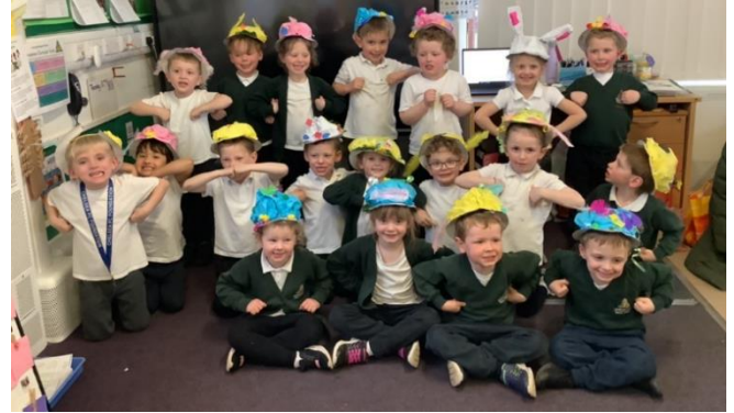
...making their Easter bonnets to go 'on parade'