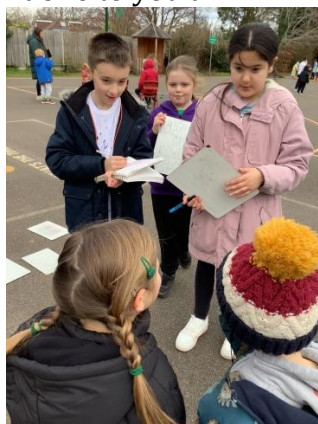
Our older children enjoyed planning activities for the younger year groups...