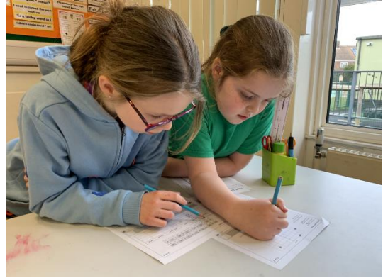
Puzzling the escape room challenges!