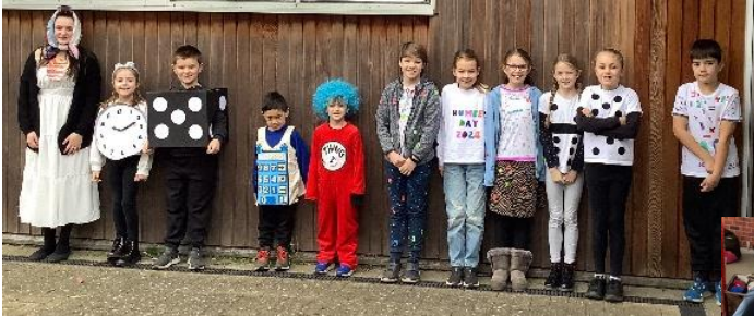
Fabulous costumes! Well done to you all!